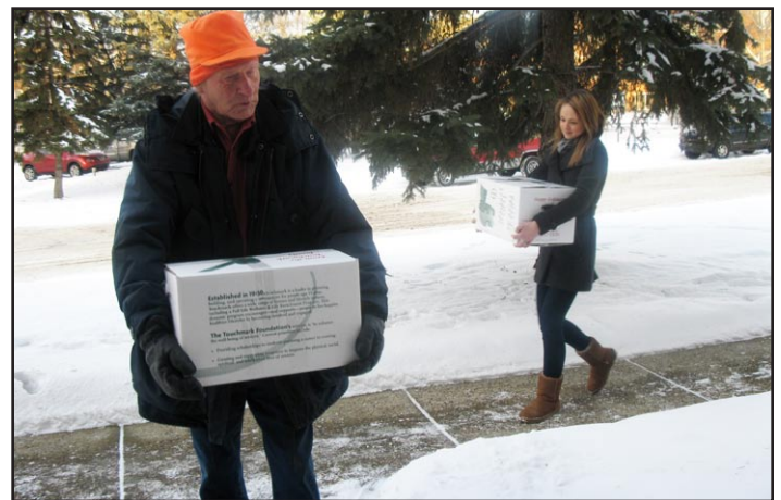
Residents and team members put together food hampers for those in need. The food was delivered to Bayshore Seniors.