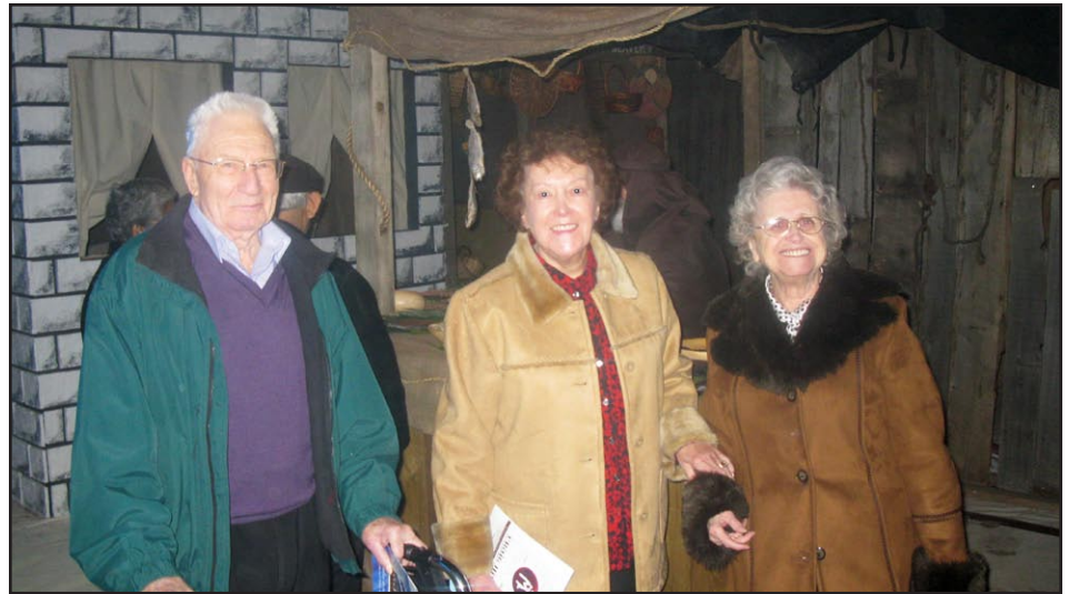
Residents toured West Edmonton Christian Assembly's re-creation of the first Christmas.