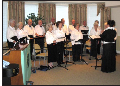
Members of the Touchmark Glee Club entertained family and friends at their Spring Concert. Following the performance, club members

participated in a wine and cheese social with the audience.