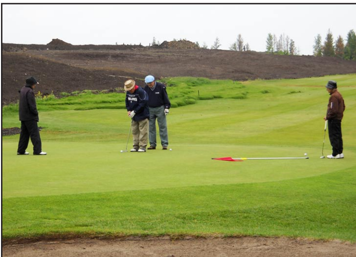
Teams gathered and played in the pouring rain for the fourth annual Golf Tournament at Lewis Estates Golf Course. A trophy was given to the winning team.